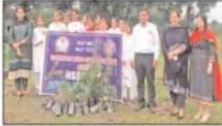
Faculty and NSS unit of college during the drive.